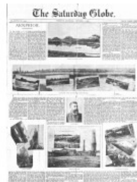
Saturday Globe 1892-10-01