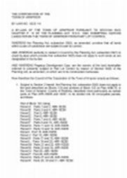
Town of Amprior Bylaw 6333-14 Part Lot Control Exemption