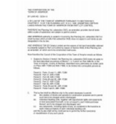
Town of Amprior Bylaw 6334-14 Part Lot Control Exemption