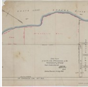
Sketch of Lot 8 in the 14th Concession ...