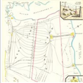
Fire Insurance Plan of McLachlin Bros. Sawmills & ...