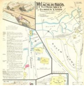
Fire Insurance Plan of McLachlin Bros. Sawmills & ...